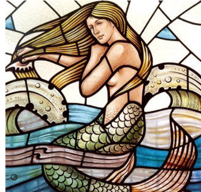
Mermaid Price: £5800.00