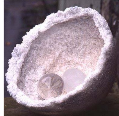
Egg Price: £720.00