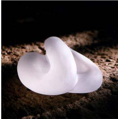
Flock / Lemniscate Price: £700.00