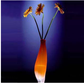
Orange Vase Price: £300.00