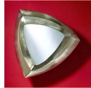
Trinity Mirror Price: £270.00