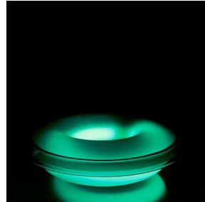
Lightbowl Price: £460.00