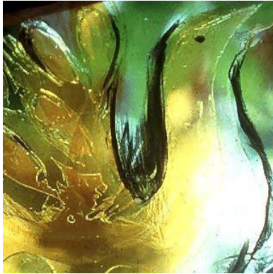
House in Jordan Price: £6500.00