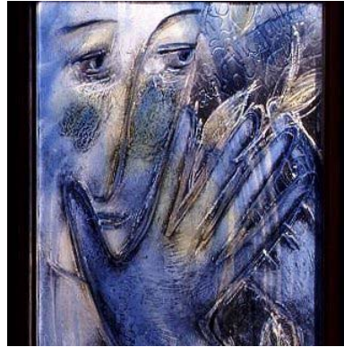
Door Panels Price: £4500.00