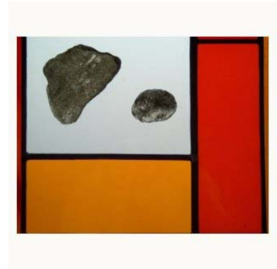
Forms and Spaces Price available on request