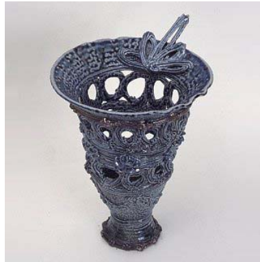
Small Cone Vessel Price: £330