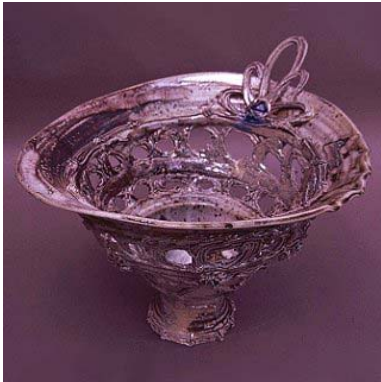
Medium Salt Glazed Bowl Price: £300