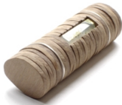
Green Phantom £245.00