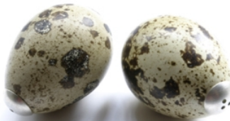
Salt and pepper £330.00