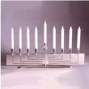
Menorah Price: £2400