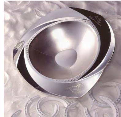
Racing Trophy Price available on request